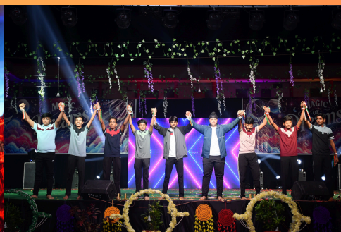
DREAM OF VICTORY