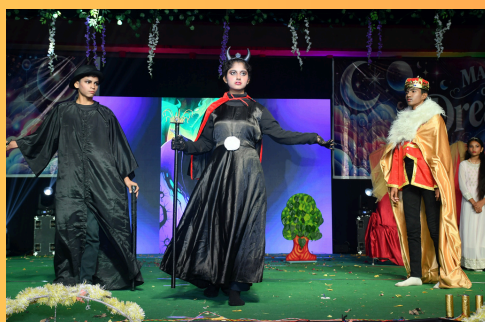
THE RISE OF NEW DREAMS: MALEFICENT