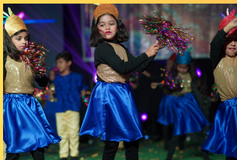
WINGS OF ASPIRATION