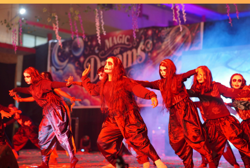
DREAM OF SPIRITS