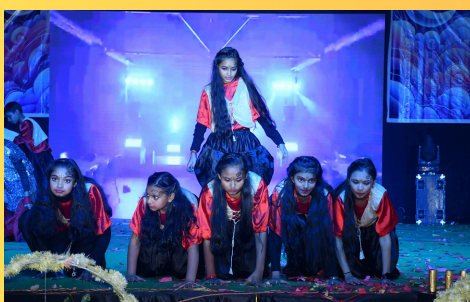
JOURNEY OF DREAMS