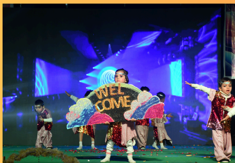
DREAMS IN BLOOM