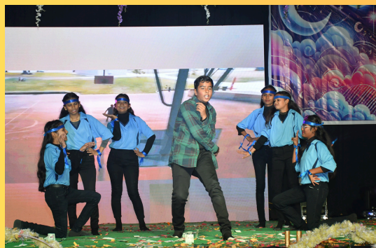
THE HIGH STAKES OF DREAMS