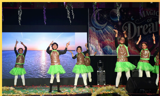
DREAMS OF LIFE