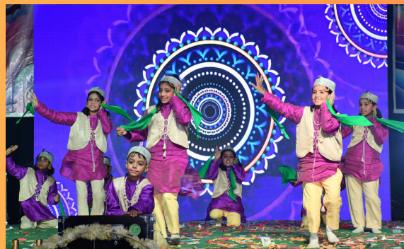
DREAM OF ACHIEVEMENTS