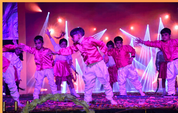
DREAMS OF FANTASY