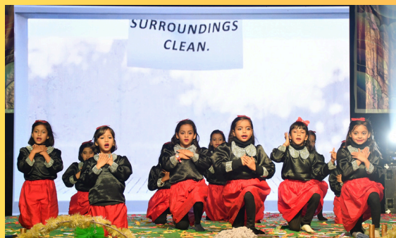
DREAMS OF CLEANLINESS